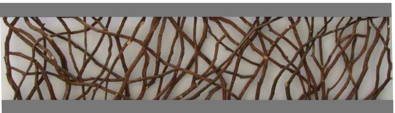
Mountain Laurel Handrail Section Preassembled and Ready to Install

Sections are built according to your post-to-post measurements and the 2x4s are left one inch long. When the order arrives, rest sections on 2x4 blocks on edge, scribe the ends of the top and bottom rails to match the posts, slide the section into place and fasten with screws. 1x4s are installed with finish nails to sandwich the ends of the sticks at top and bottom. To finish, a 2x6 is installed as a top cap, placing all screws and fasteners to be hidden.