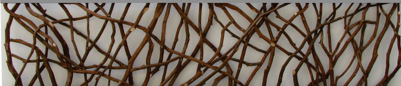
Mountain Laurel Handrail Section Preassembled and Ready to Install

Sections are built according to your post-to-post measurements and the 2x4s are left one inch long. When the order arrives, rest sections on 2x4 blocks on edge, scribe the ends of the top and bottom rails to match the posts, slide the section into place and fasten with screws. 1x4 are installed with finish nails to sandwich the ends of the sticks at top and bottom. To finish, a 2x6 is installed as a top cap, placing all screws and fasteners to be hidden.